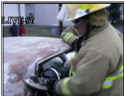
TRAINING SAVES LIVES!